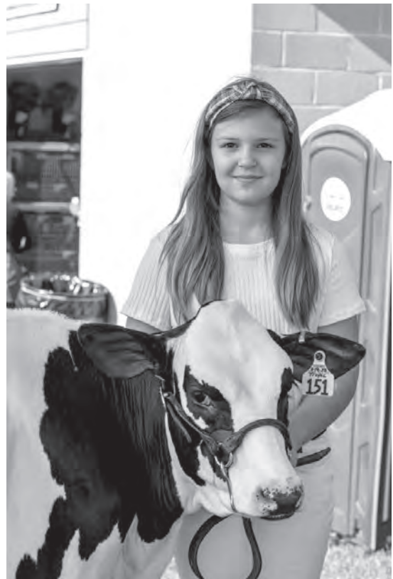
Smile pretty for the camera